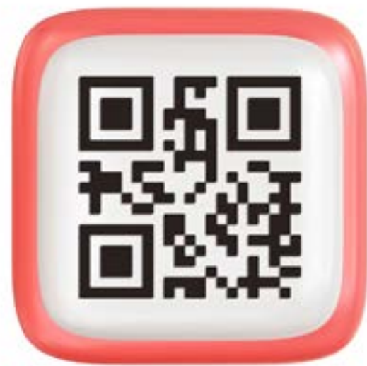
Barcodes, QR, batch codes