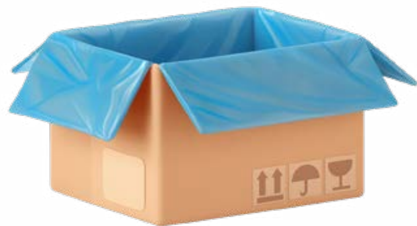
Flexible sizes: 400g, 1kg, 10kg, 25kg or Custom